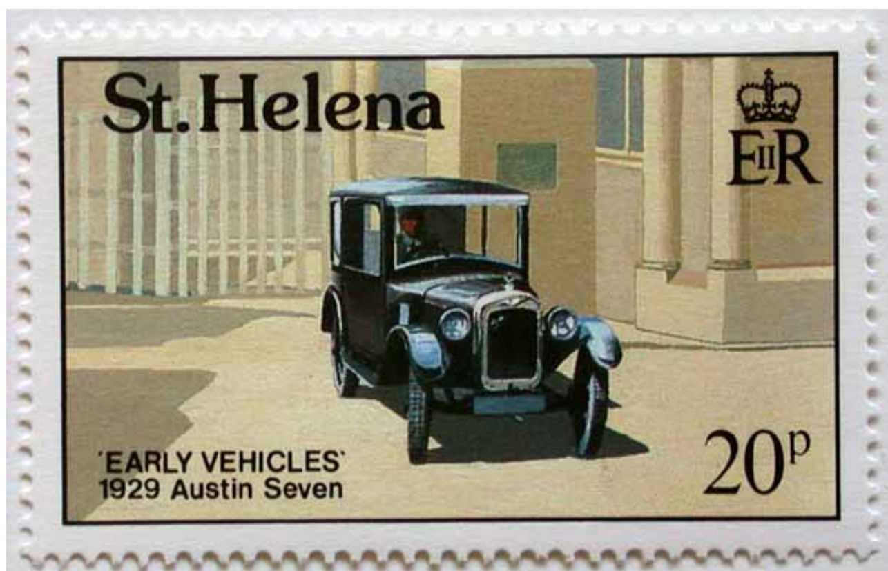
A Saint Helena Stamp part of a series celebrating the Island's early vehicles.