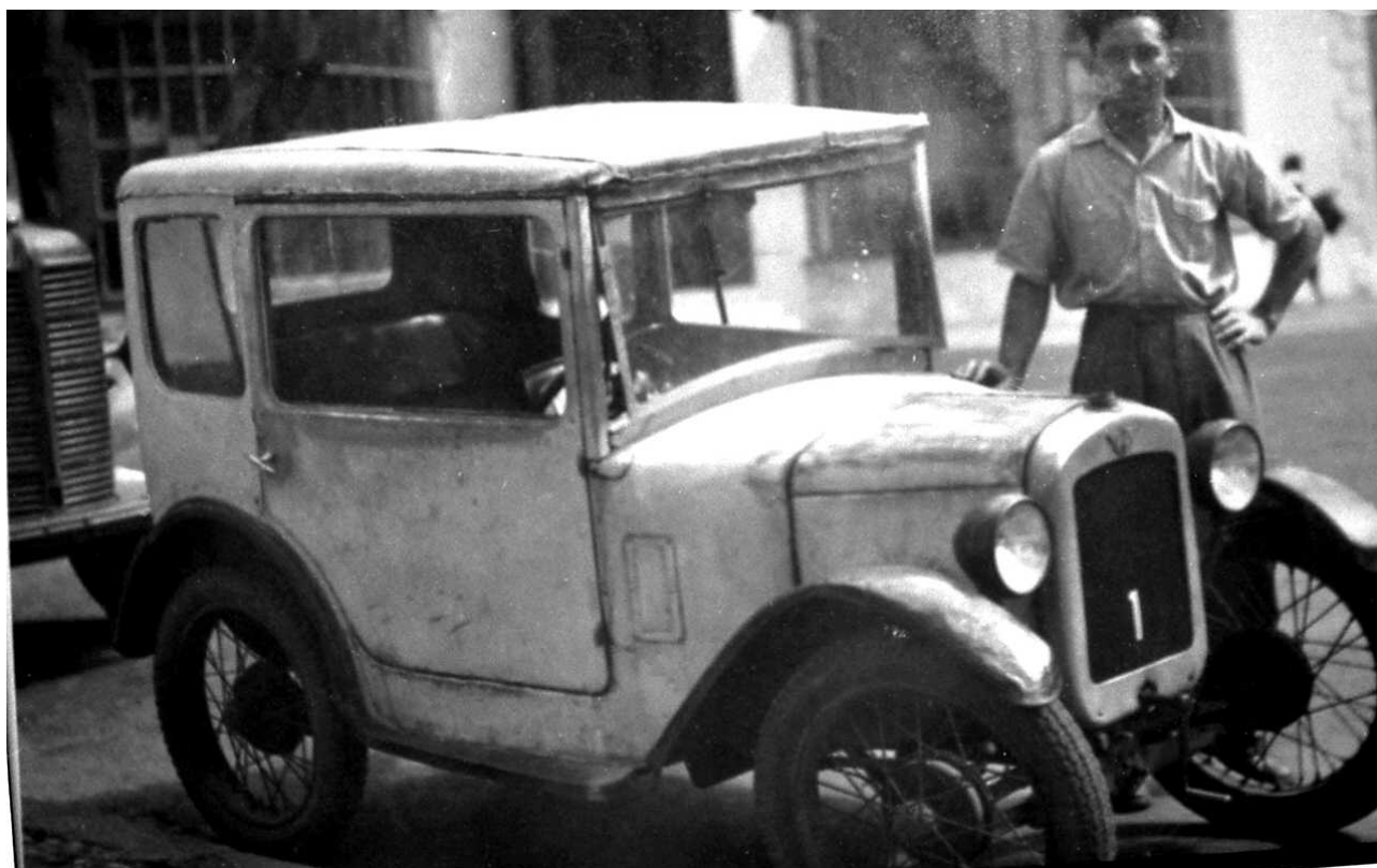
The Number 1 in 1935

Recently whilst idly browsing photo's of sevens on the internet, I happened across a black and white image of an RK Saloon with distinctive white '1' on the radiator (shown above). Interest peaked, I followed the link to the website, to try to find out more about the car, the result being quite astonishing. The website I arrived at was www.sainthelenaisland.info , an interesting, informative and entertaining website about this remote outpost in the South Atlantic Ocean, famous for, amongst other things, being the place where Napoleon Bonaparte lived out his final years in exile. The story of the car in the picture, as covered on the website, was far more than I could have imagined, and I hope that you will enjoy my retelling of the story here.