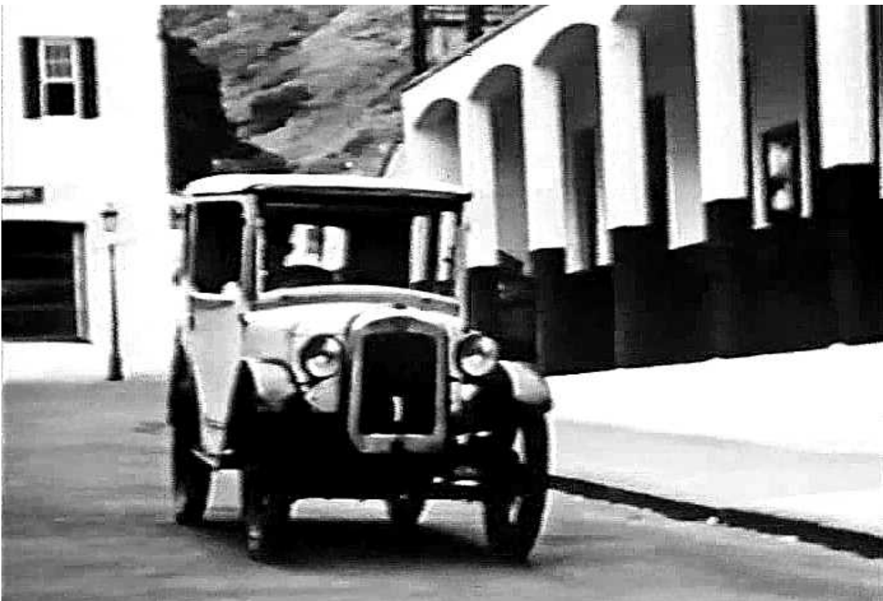
A still from the 1962 film 'Island of Saint Helena'