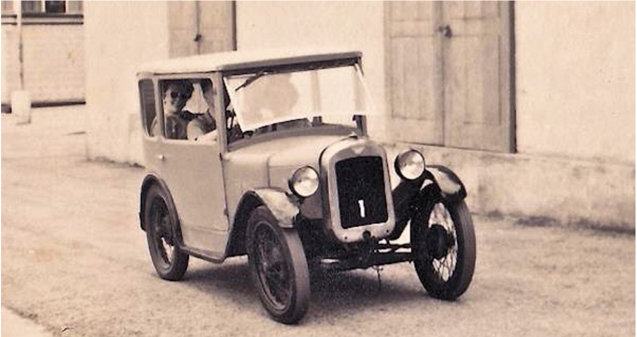
This image was found on worldlicenseplates.com