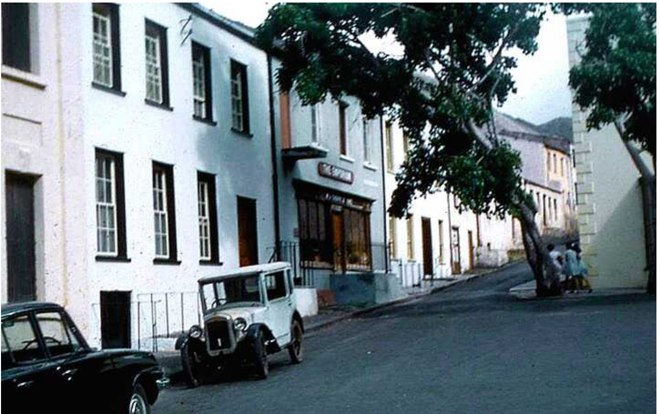
The most recent known Photograph of 'The number 1' thought to be the 1970's