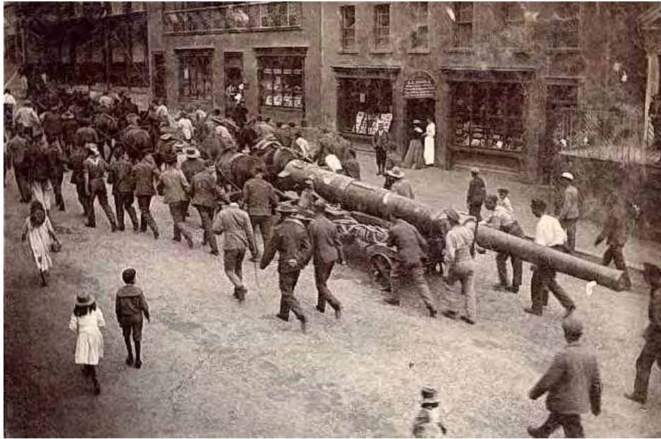
New coastal defence gun being hauled up Main Street in 1902 18

government to compensate landowners, owners of stock, and others whose interests are very seriously menaced by the withdrawal of the troops.” Amongst several other points, the Committee refuted Haldane’s claim about the two obsolete and misplaced guns in the event of an attack, stating two modern guns had been installed at St Helena in 1903 and additionally “some twenty guns scientifically placed, so as to command the approaches of the island”. 17 The veracity of this is demonstrated by the image below of one of these new guns being hauled up Main Street in 1903.