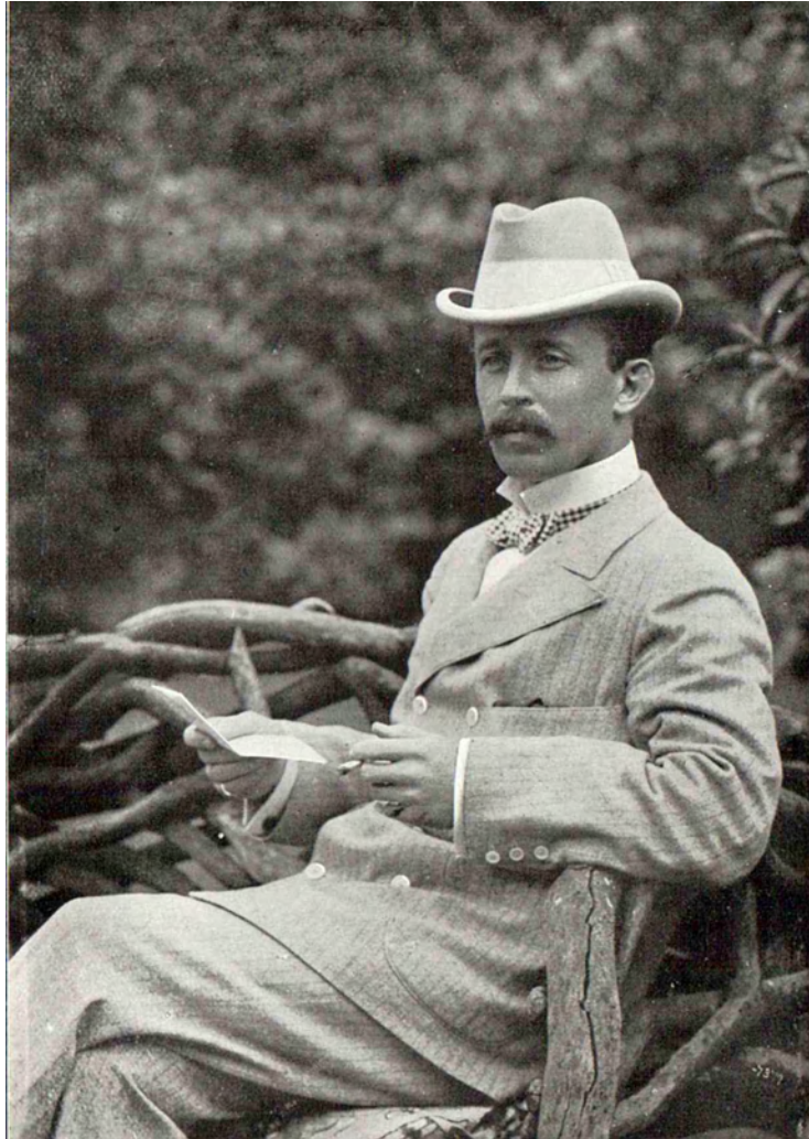
Henry Gallwey in 1903 12

of the inhabitants and the absence of skilled labour, it was useless to look to private owners to carry out the necessary connexions on their own premises. The government decided to do the work and recover the cost by instalments. No option was given to owners and occupiers. Unfortunately it would seem that work on private premises has been carried out on too elaborate a scale. The Governor reports that ‘the value of the drainage and water fittings in many buildings far exceeds the value of the buildings and contents. The result is that the poorer classes in Jamestown are burdened with a crushing load of debt’ . . .” 13