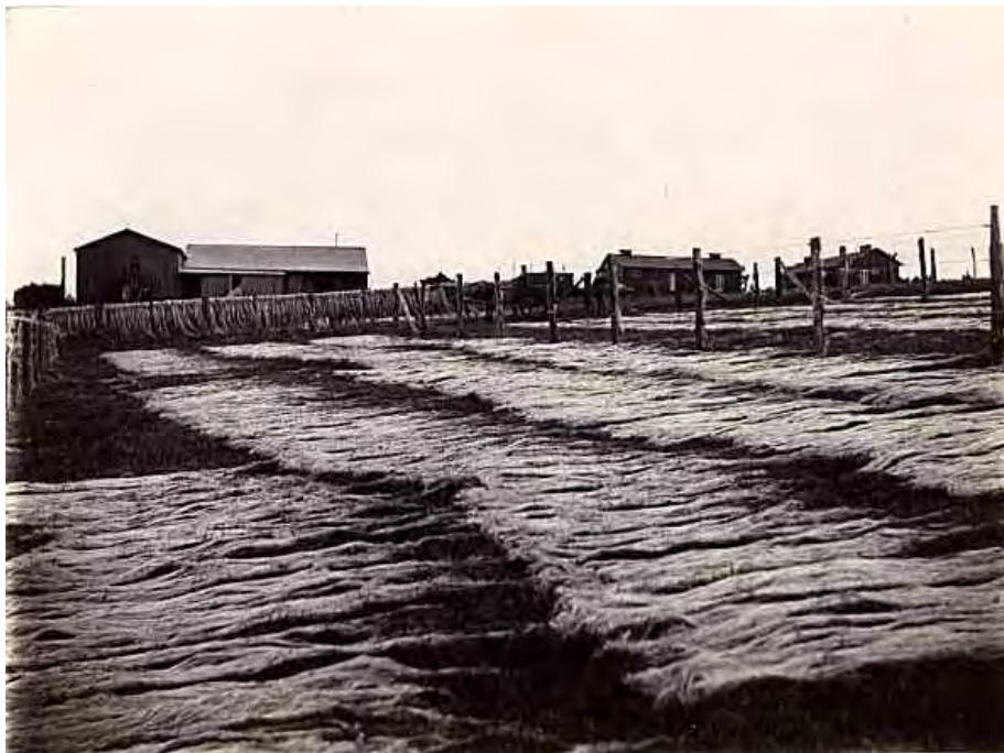
First Flax Mill and drying field at Longwood, photographed in 1908 24

this time, but St Helena's flax industry struggled on for almost another 30 years as the world's only exporter of Phormium tenax fibre.